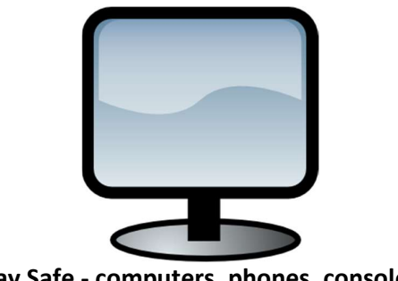
Stay Safe - computers, phones, consoles!

Computers, phones, consoles give you lots of opportunities to talk to your friends, be creative and to learn new things. You are entitled to be safe all the time. Our school will make sure you have good access to ICT so that you can learn but we want you to agree to be a responsible user of ICT. Our school system is safe and will protect you from anything that may put you at risk.